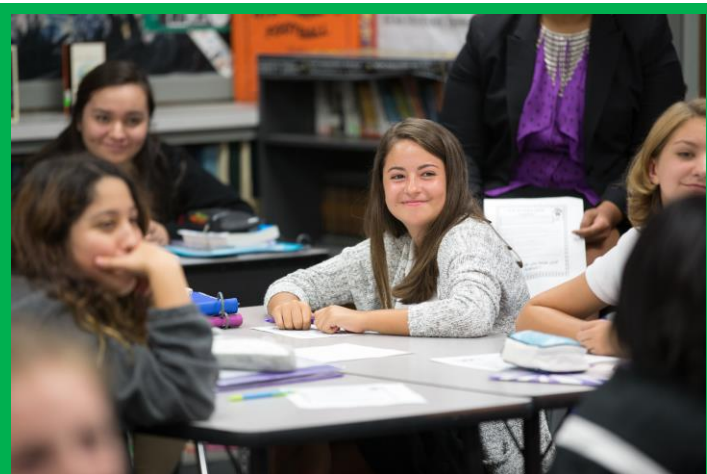
Tulsa Public Schools photo by Tracy Kouns.