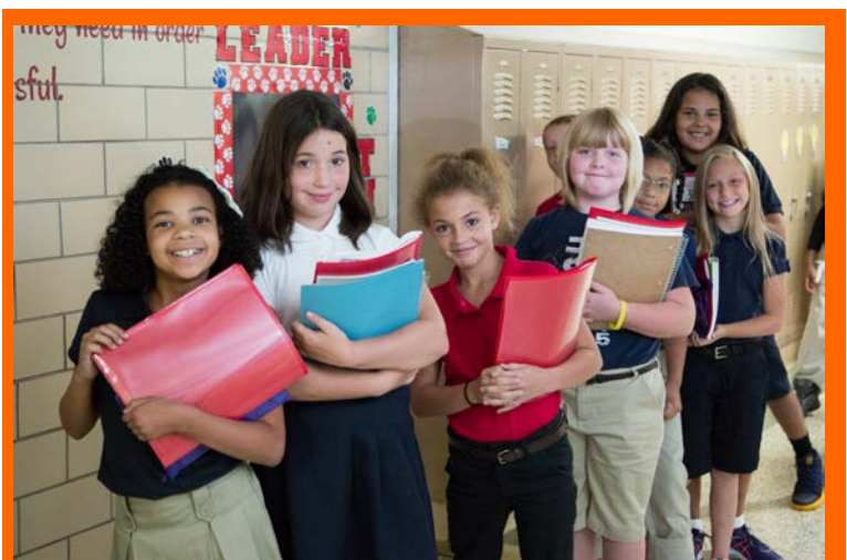
Tulsa Public Schools photo by Tracy Kouns.