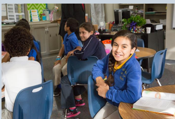
Tulsa Public Schools photo by Tracy Kouns.

http://www.nctm.org/Grants-and-Awards/grants/Program-of-Mathematics-Study-Active-Professionalism-Grants/