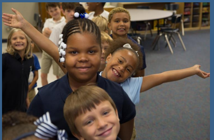
Tulsa Public Schools photo by Tracy Kouns.

http://www.nctm.org/Grants-and-Awards/grants/Enhancing-Student-Learning-through-the-Use-of-Tools-and-Technology-Grants-(Pre-K-12)/